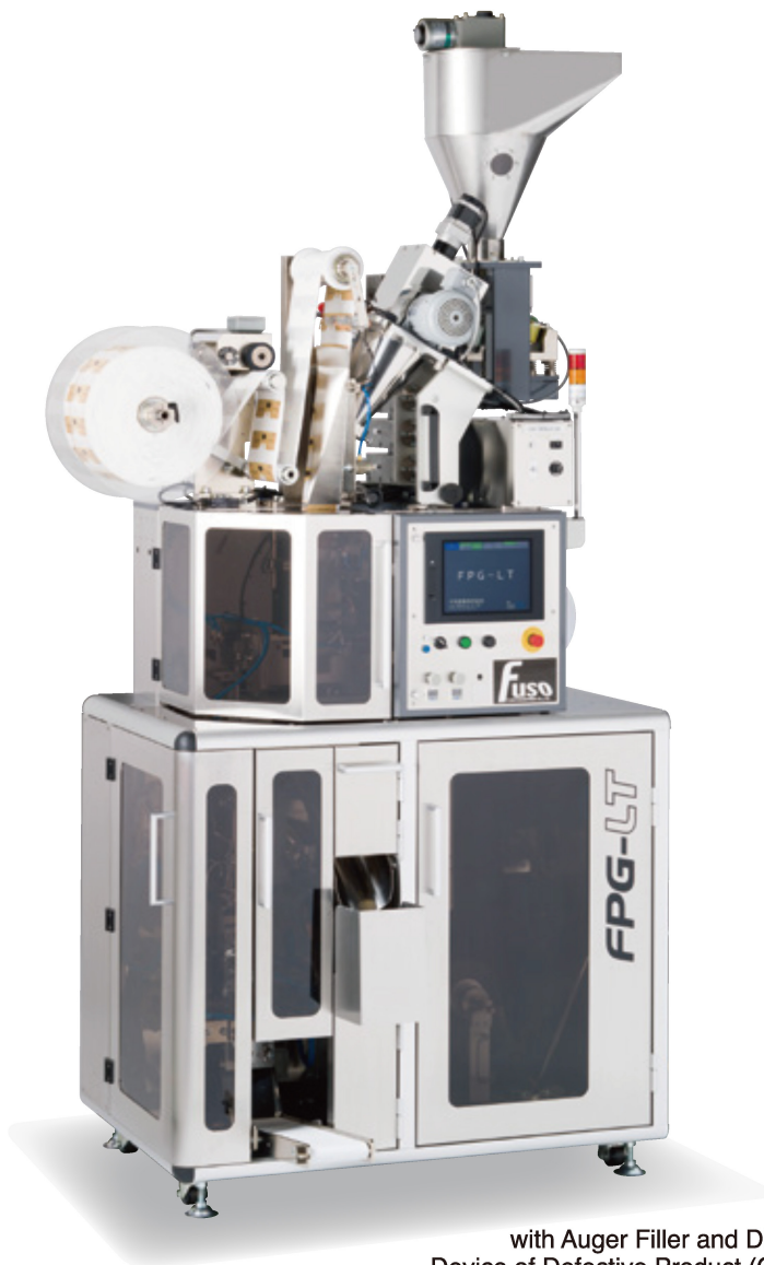
with Auger Filler and Discharge Device of Defective Product (Optional)